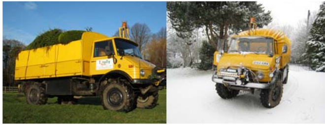
First up is this lovely U1100L owned by Totally Trees. Perfect vehicle for a ride in the snow! Visit our website for more info.