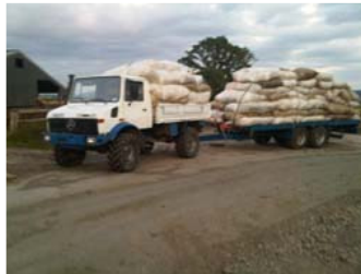
Last but not least is this U1300L carrying quite a load! It was up in our workshop recently have a bit of T.L.C. to keep it up to scratch! Click here to go to our newsletter.