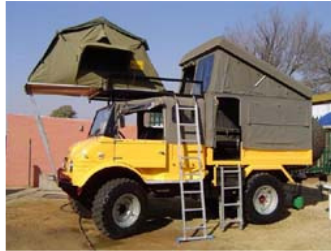
Next is this 416 that has been converted into a rather interesting looking camper! Visit www.samog.co.za to see more weird and wonderful conversions including a 416 that can carry up to 22 people!