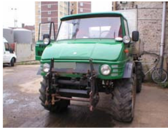
This U900 is being lovingly restored at a garage down in London. There's quite a bit of work involved but it'll be back terrorising the streets of London in no time! Read more about this mog at our newsletter.